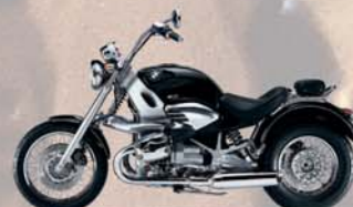
730, Night black