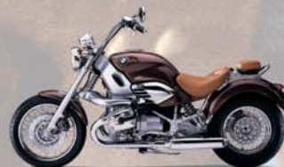
840, Mocca Brown Metallic, dualseat saddle brown*