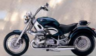
838, Sorrent Blue Metallic