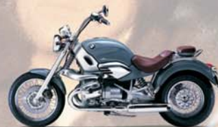
954, White Aluminium-Metallic Black dualseat optional*